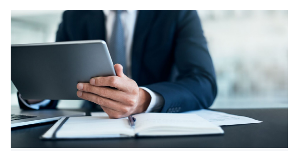
Consistent KPIs to assess all suppliers