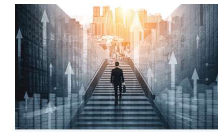
Minimized costs with tailored industry standards