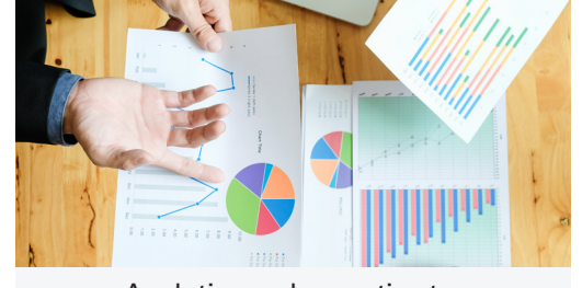
Analytics and expertise to translate data into actions